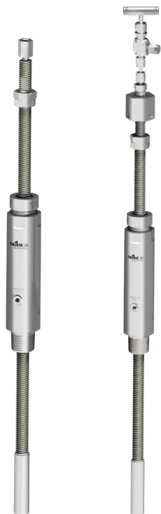
(Low Volume Option)